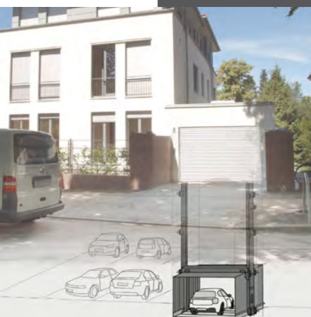
PEGASOS® car lift, private building