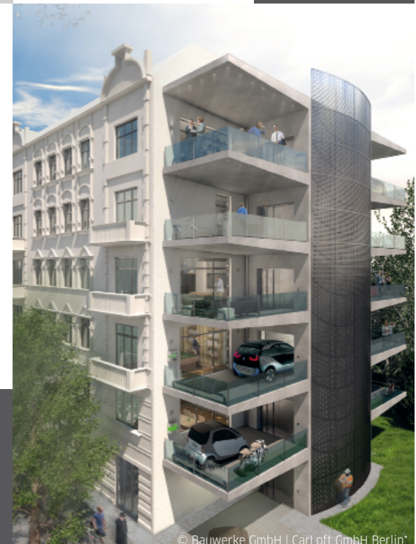
© Bauwerke GmbH | CarLoft GmbH Berlin