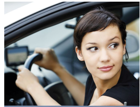
CarLoft GmbH Berlin, multiple dwelling