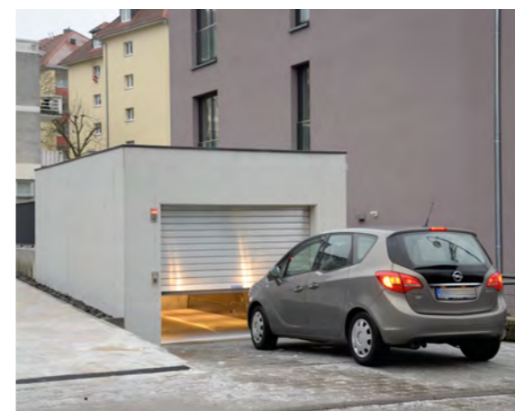
PEGASOS® car lift, private building