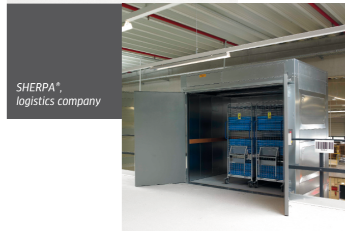
SHERPA®, logistics company