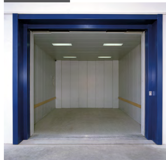
Customised goods lift, electrical appliance manufacturer