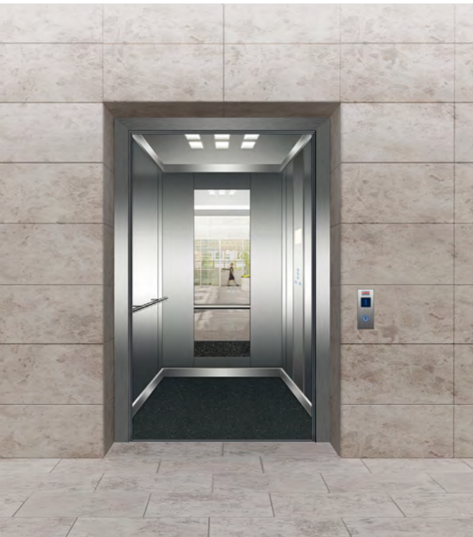
ELEGANCA, special design

High riding comfort and numerous configuration options are just some of the features our customers always appreciate. Thanks to the variety of models, we are always able to offer the right solutions, whether a new or existing building is concerned.