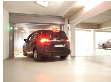
Car lift, private building