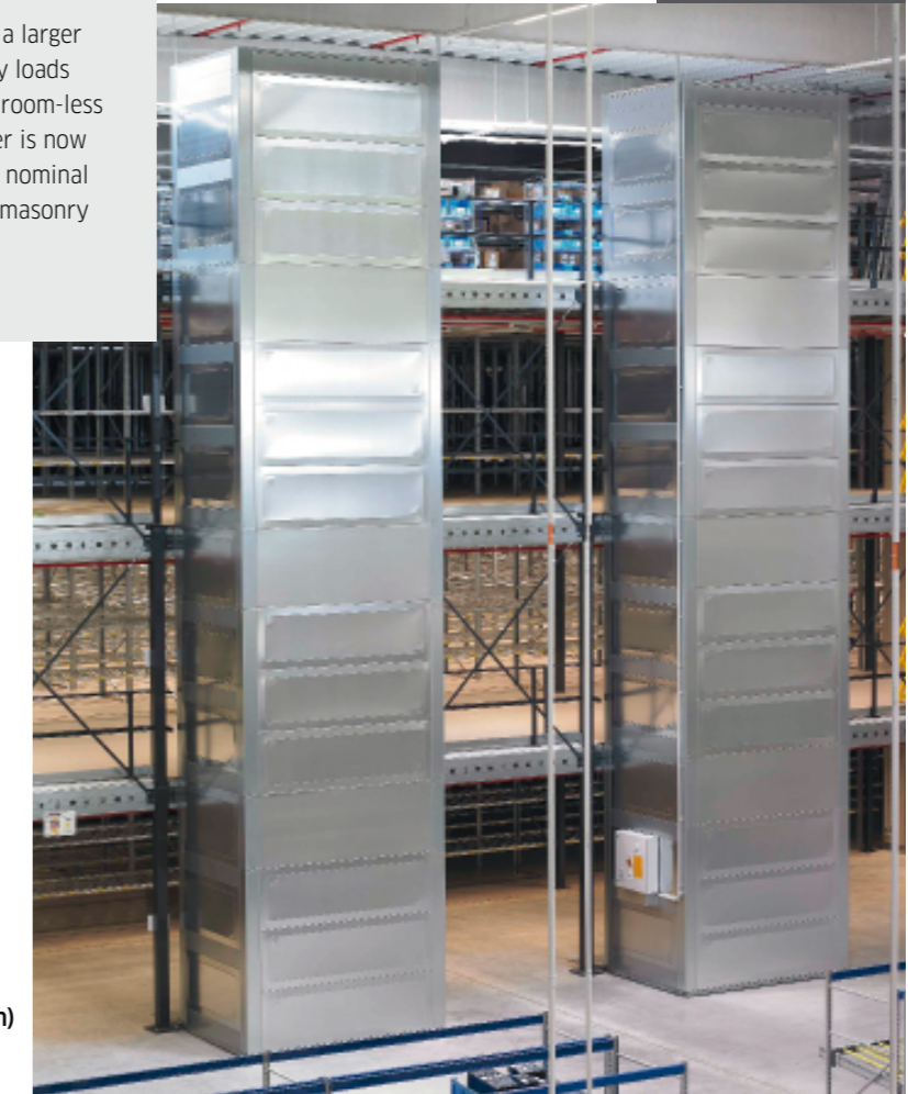
SHERPA®, e-commerce company

( https://www.lodige.com/SHERPA-configurator/?lang=en )