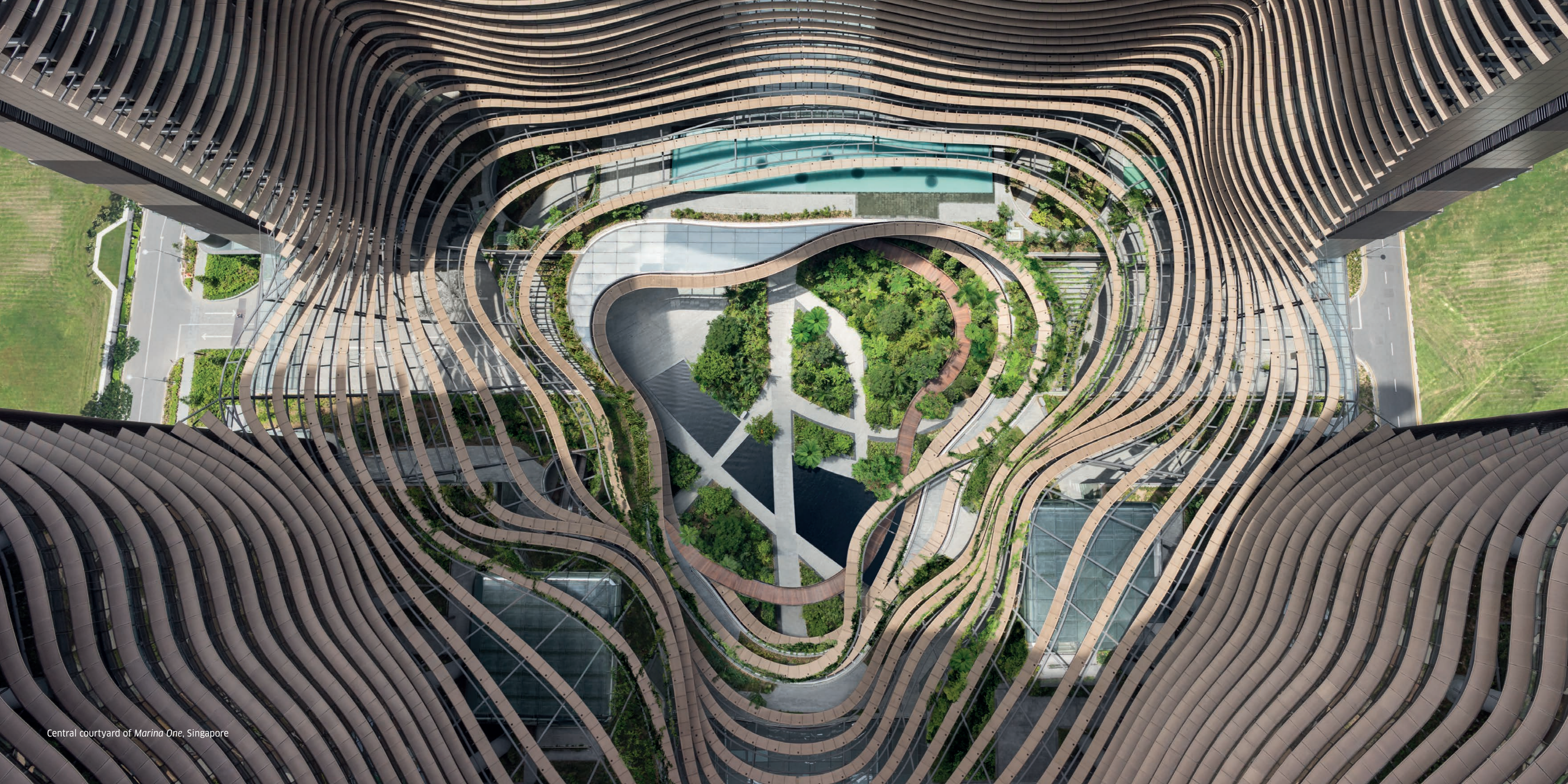
Central courtyard of Marina One , Singapore