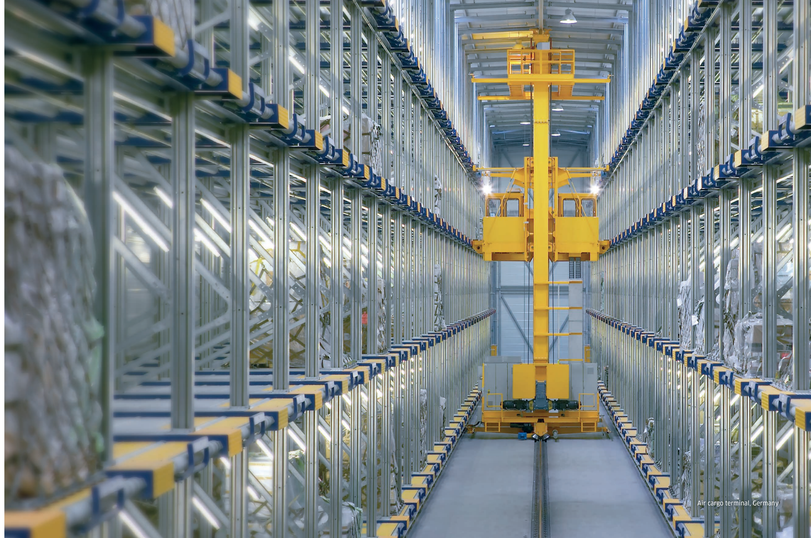
Air cargo terminal, Germany