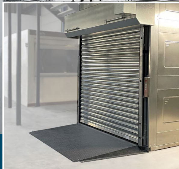
SHERPA® with roll shutter doors